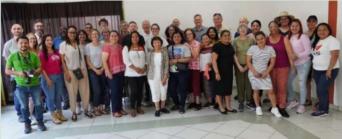
Attendees at the Central America Mission and Migration Network launch in San Salvador