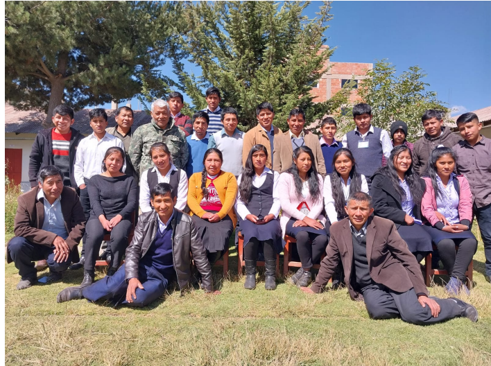
Left: Recent meeting of the Women's Ministry course in Cuzco, Peru. Right: Students of the 2022 academic year of the IEP Seminary in Sicuani (Cuzco), Peru.