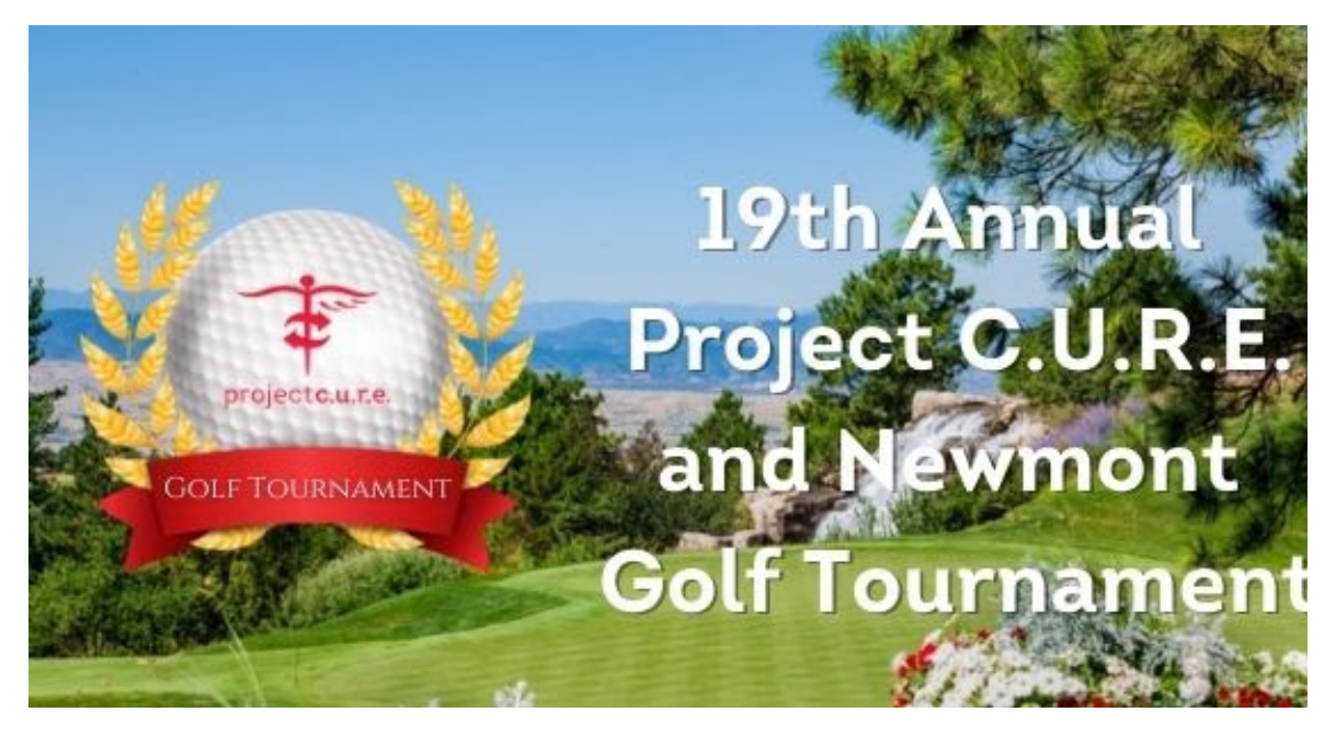
19th Annual Project C.U.R.E. Golf Tournament