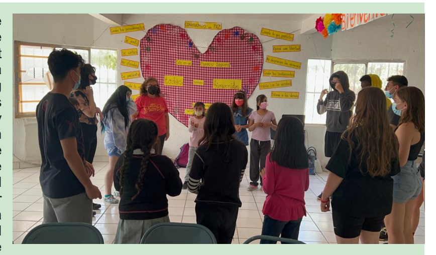
Students from Menaul School lead an activity with the kids at the Children's Enrichment Ministry

Children at the New Hope Community Center (in the Children's Enrichment Ministry) enjoyed a visit by a group of international young people from Albuquerque's Menaul School, who happily participated in activities with the children even though the language barrier may have been a challenge. But facial expressions, drawings, or showing an image on a computer facilitated communication and the desire show to representatives of their country of origin, in addition to dancing through an imitation song and writing the word Hope in each of their languages.