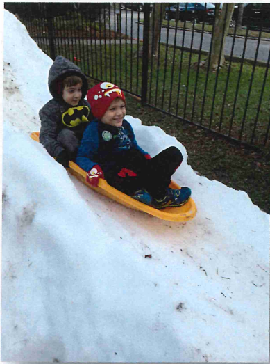
Every January ELP has Snow!