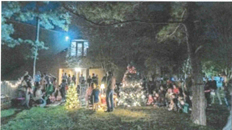
ELP Night Tree Gathering